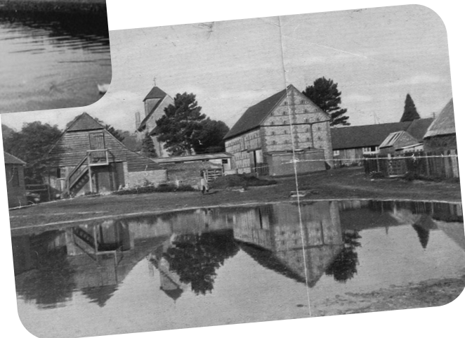
The photo to the right is of Clayton Farm.