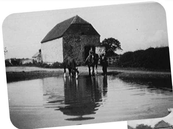
The above photo is of Lodge Farm taken in 1924.