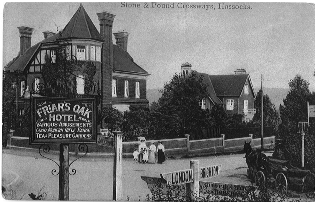
Stone & Pound Crossways, Hassocks.

VAT FREE Call for a free estimate or advice 01273 844946 07854 327020 VAT FREE