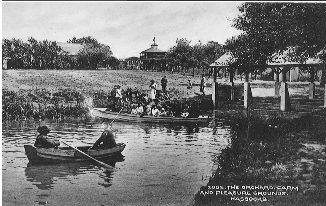
2002. THE ORCHARD. FARM AND PLEASURE GROUNDS. HAS30CKS.

Call for a free visual electrical inspection of your home