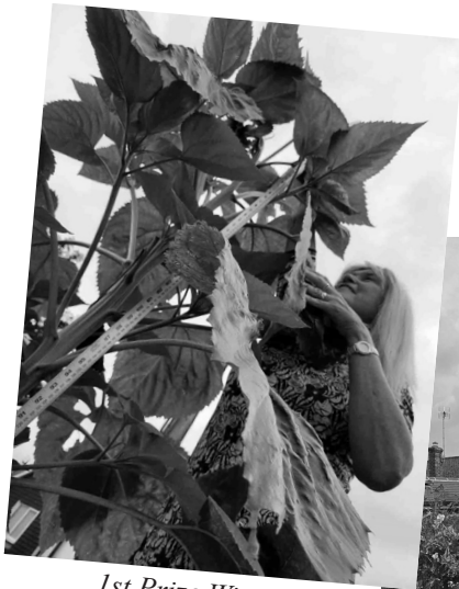
1st Prize Winners B