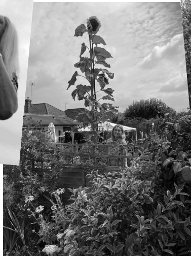
2nd Prize Winners A