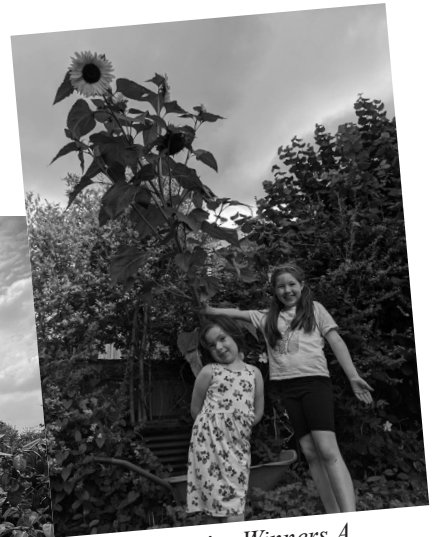
2nd Prize Winners A