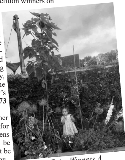
1st Prize Winners A