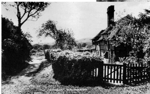
Cowdray Cottage, Hurstpierpoint