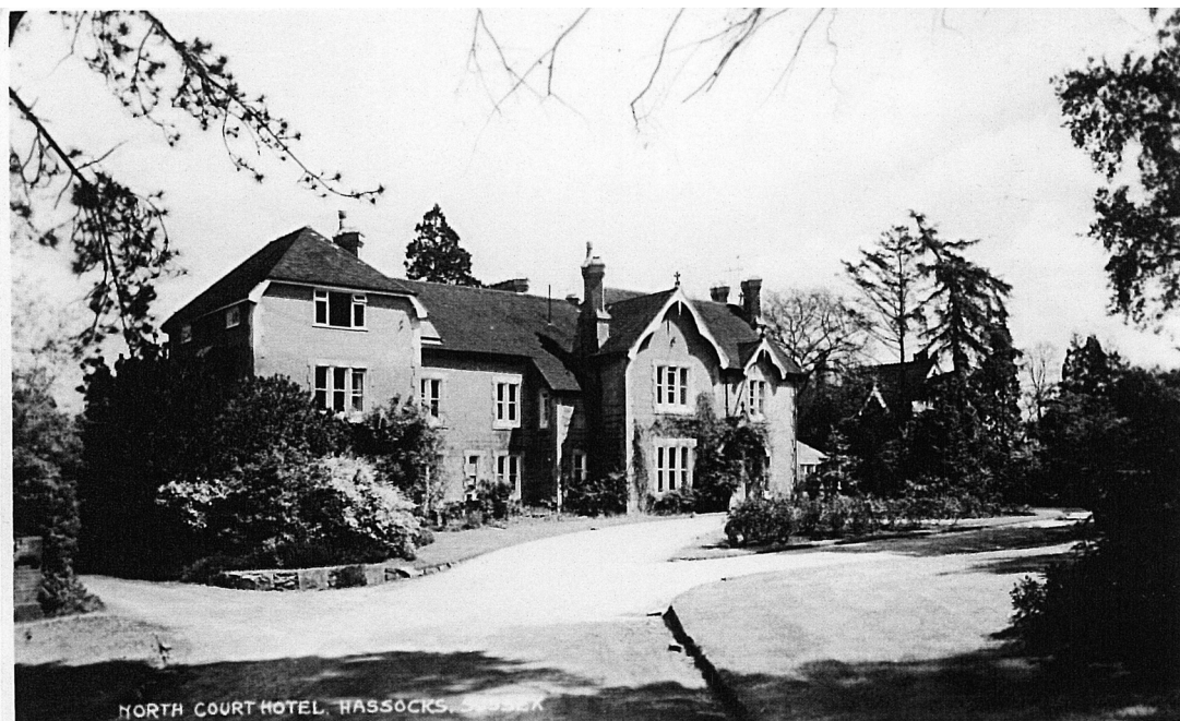
NORTH COURT HOTEL, HASSOCKS, SUSSEX