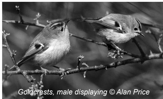
Goldcrests, male displaying

THE LITTLE KING In this, our littlest month, I'd like to celebrate our littlest bird, the Goldcrest. Crowned with a yellow tuft, this aptly named species has an equally grand and, if you ask me, quite adorable, Latin name: Regulus regulus , or 'little king'.