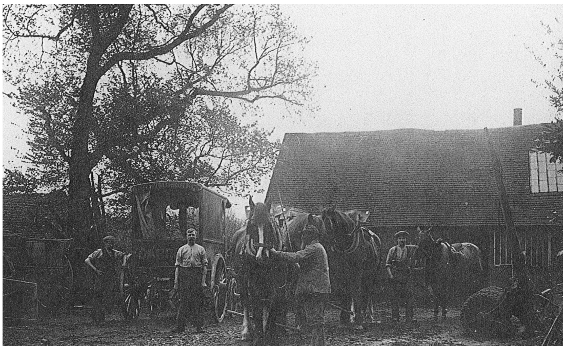
of the old blacksmiths in Albourne