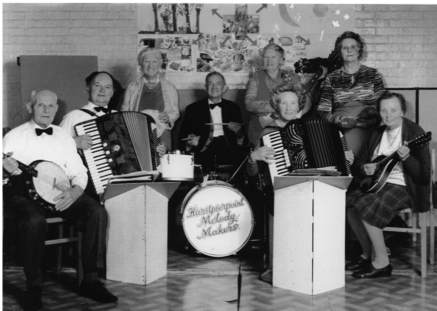
of Hurstpiepoint Melody Makers taken (we think) around 1970' - 80's

FREE LOCAL DELIVERY • FREE LOCAL DELIVERY • FREE LOCAL DELIVERY